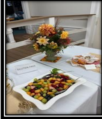
Gorgeous Display of Delicious Luncheon options and desserts