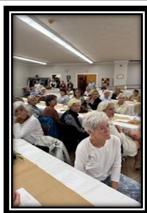
Members seated at the beginning of meeting.