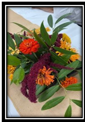
Beautiful Floral Bouquets created by members.