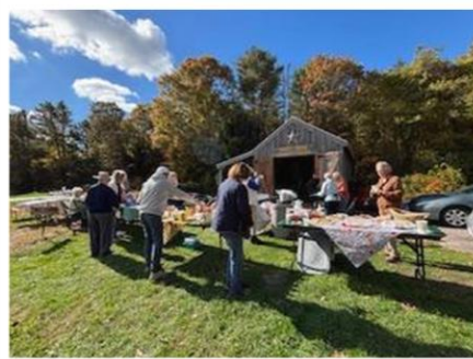
Member/Gardener/Friend Luncheon after Dedication Ceremony