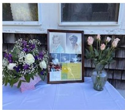
Tribute Table to Kit with Photo Collage and Roses