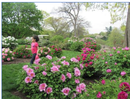
Oh Boy! Here comes Color!