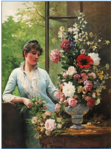
"Preparing the Flower Arrangement"