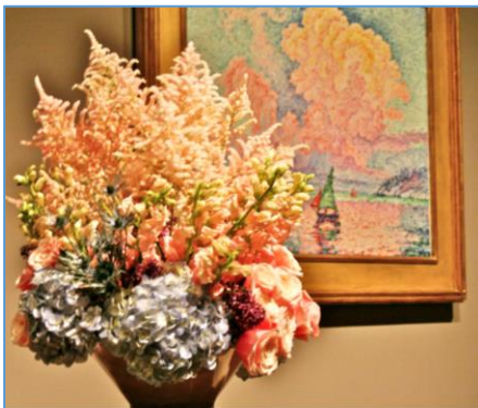
Floral arrangement inspired by Paul Signac's "Pink Clouds"

Art in Bloom is at the MFA in April. Applications are due in November.