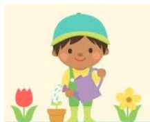
Gardens Kids Can Grow (Members of Gardeners) Visit: AmoldForAll.net/VATN/Cleaning.com

We are looking for two volunteers to help run one of the Jr. Gardener's meetings at the Bournedale Elementary School on either Wednesday May 25th or June 1st. There will be 12 third graders in the class and the