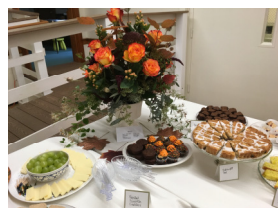
“MFA Art in Bloom Roadshow.”

Aptucxet Garden Club past presidents and Presidents of other SE District garden clubs were invited to a delightful luncheon and program